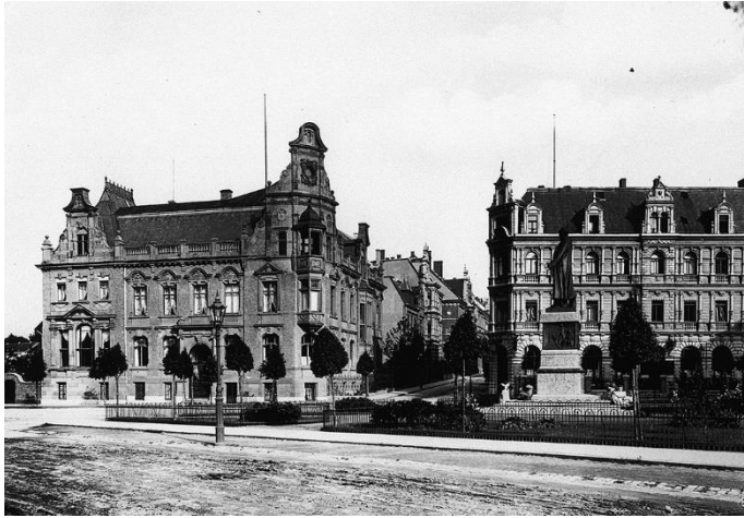
Founded in 1840