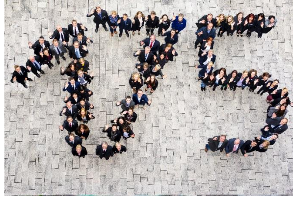
109 employees + 7 apprentices