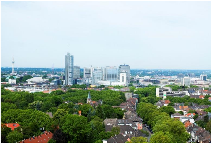
around 57,000 member companies