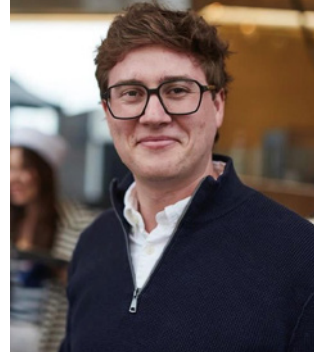
Höcker Polytechnik GmbH

Borgloher Str. 1 | D-49176 Hilter a.T.W. | ☎ +49 (0) 5409 405-0 @ info@hpt.net | 🌐 hoecker-polytechnik.de