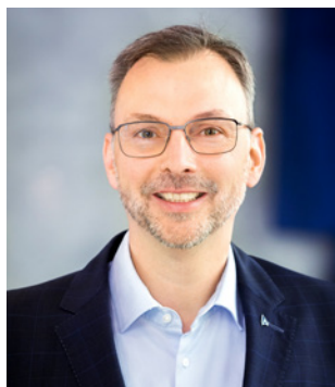
Kampmann Group GmbH