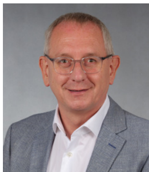
Kleymann Oberflächen- technik GmbH