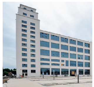
IHK Offices Osnabrück, Lingen (Emsland), Nordhorn (Grafschaft Bentheim)