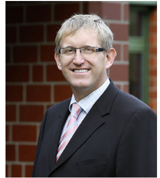
AK System GmbH