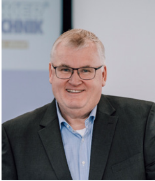
Höcker Polytechnik GmbH