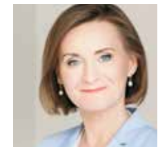
DR. SIGRID NIKUTTA CEO and COO

– BVG is not only famous for its yellow trains and buses but also for its striking marketing